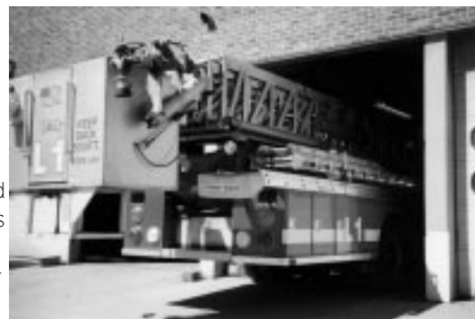
The current facility is too small to accommodate some of the Township's public safety vehicles.

"The building is at the end of its useful life." "The existing fire alarm system is inadequate and has little value." "The roof ... will likely fail soon..."