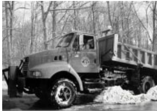
Response time for clearing roads in winter weather is slowed down by inadequate garage space.

Road crews trying to respond quickly to emergency winter road conditions are slowed down because of the limited garage space. Many trucks must stay parked outside and during winter storms they become covered with ice and snow. Before they can be deployed, they must wait in line to get into the garage so they can be de-iced with a hot water hose. Then, the trucks are delayed some more while they are warmed up enough to allow the hydraulic systems to function properly. These steps significantly reduce response time.