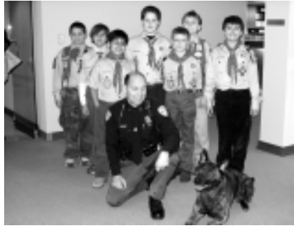
Cub Scout Troop 1214 thanks the Township Police Department for its service