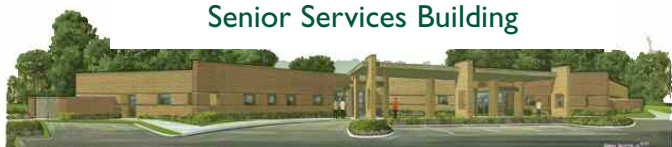
Senior Services Building

The new Senior Center will have enough space for on-site Adult Day Care and offer features such as a therapeutic pool. It will also bring seniors to a more central location.