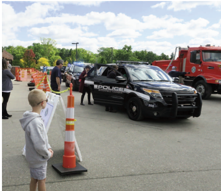
Rides in police cars were popular with adults and kids.

The visitors spent the afternoon engaged in a host of activities for adults and kids. There were rides in police cars and DPW trucks, a chance for the kids to go through a fire training exercise including operating a real fire hose, a K9 demonstration, and much, much more. The only glitch was that the Beaumont Hospital helicopter canceled its visit. It had to go on a real medical run.