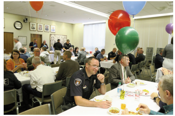
There was a good turnout of Township employees at the luncheon.