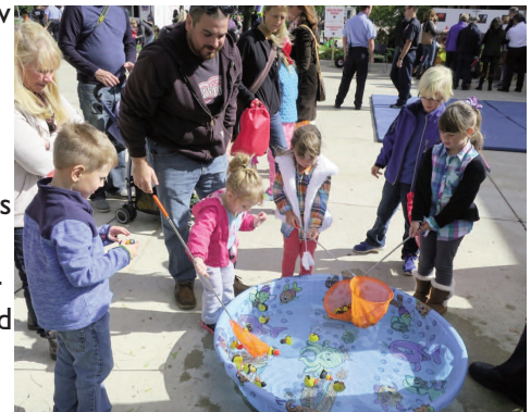
Kids caught ducks in a plastic pond.

Open House is held in conjunction with Fire Prevention Week. Theme of this year's week was "Don't wait. Check the date. Replace smoke alarms every 10 years."