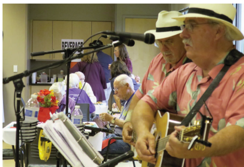
Musicians added to the fun at the Friendship Club celebration.

Friendship Club is dedicated to assisting older adults with Alzheimer’s disease and related memory loss to maintain their highest levels of ability. It’s a warm, friendly place that offers care and respite for families with special needs. For more on Friendship Club, go to the Township’s website, www.bloomfieldtpw.org .