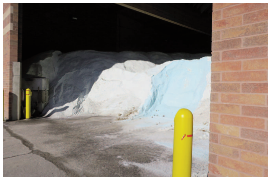
The salt is sitting, waiting to be loaded into the trucks and spread.

predicting it, I'd be a millionaire," Domine said.