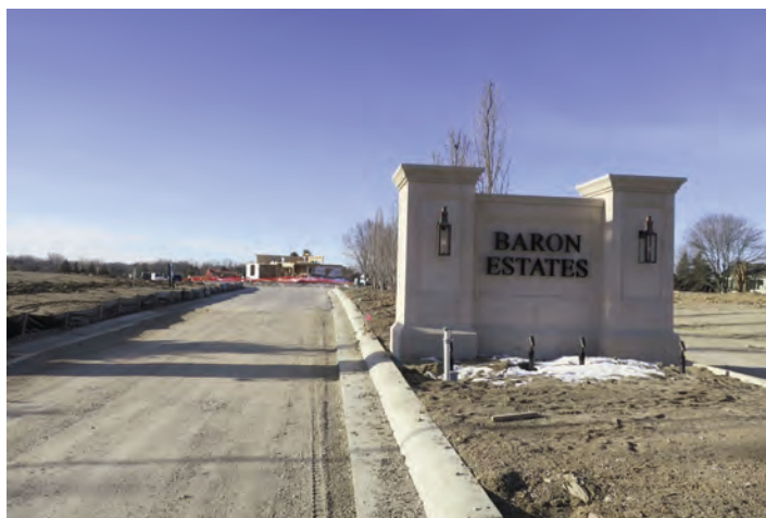
Baron Estates is being developed now on Long Lake Road.

mits are increasing: 70 were issued in 2017 compared to 59 in 2016.