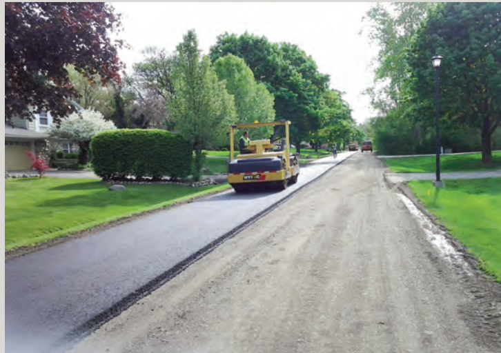
Some Township neighborhoods have had their roads repaved by passing SADs for reconstruction.

ferent issue. Bloomfield Township will repair potholes and do minor overlays as well as some concrete replacement. We will spend approximately $800,000 this year on these repairs but frankly all this is doing is putting a bandaid on a deep puncture wound.