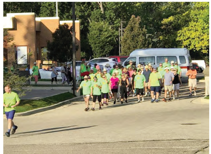
Last September's Active Compassion Walk drew a large and enthusiastic crowd.