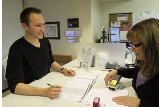
Clerk's Office staff are always ready to assist new residents with voter registration and more.

an absentee ballot. There are rules for voters who move within and those who move outside the jurisdiction. So don't wait until an election to determine where