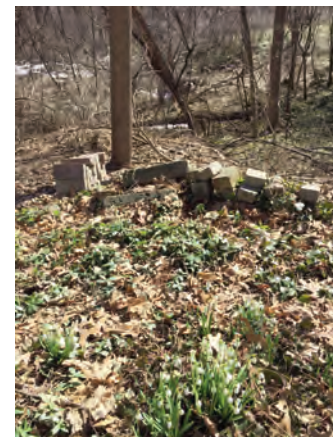
The appearance of the first spring flowers are a reminder it’s time to get busy with seasonal tasks.

at (248) 433-7715 and someone from our staff will be happy to assist you.