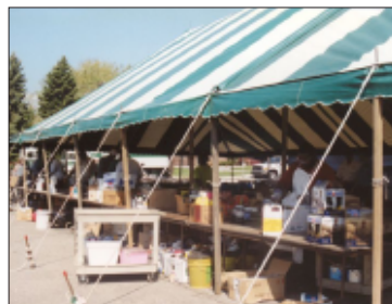
A community the size of Bloomfield Township discards seven tons of liquid household cleaner each month.

ers have take-back programs for a minimal charge. In addition, there are a number of Michigan-based e-waste recyclers who will accept electronic equipment for a reasonable fee. See a list at www.michigan.gov/deqrmmd , click on the "Miscellaneous" category and choose "electronic equipment" in the form.