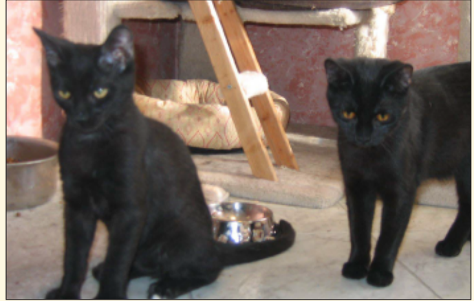
Photos and descriptions of lost pets will be cablecast on BCTV Channel 15 Monday Friday at 8:30 a.m. and 5:30 p.m. and Saturday and Sunday at 8:30 a.m., 3 p.m. and 11:30 p.m.

BCTV's Lost and Found cablecast times will be: Monday through Friday, 8:30 a.m. and 5:30 p.m. Saturday and Sunday, 8:30 a.m., 3:00 p.m. and 11:30 p.m. If you have lost your cat or dog, or if you have found someone else's and don't know where to return it, send a picture of the pet to the Cable Department at cable_dept@bloomfield-twp.org or send a print of it to the Cable Department, 4200 Telegraph, Bloomfield Hills MI, 48302. Include a brief description, the pet's name (if known), and the general vicinity the pet was last seen. You may also call the Animal Shelter at 433.7757.