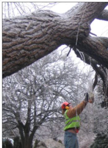
Ice build-up brought down trees and power lines which prompted numerous calls to the Police and Fire departments.

The training consists of a free 20-hour program combining hands-on exercises with classroom lectures.