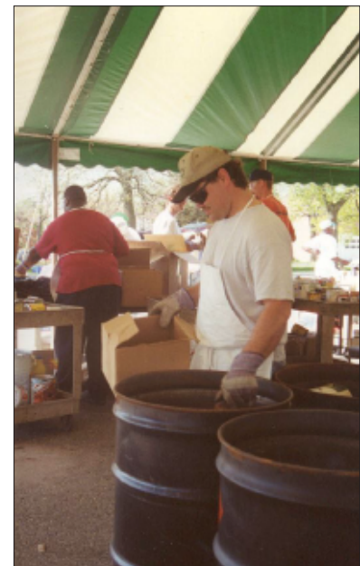
Household Hazardous Waste Drop-Off Day is Saturday, May 5th, at the north parking lot of the Bloomfield Township administration building.