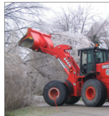
The ice storm that pounded southeast Michigan Jan. 15, kept Dept. of Public Works, Police and Fire personnel busy but their ability to respond to emergency situations was helped greatly by the efforts of the Township's CERT team.