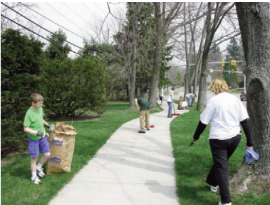
Residents take part in Clean Sweep

Township residents have been participating in Household Hazardous Waste Drop-Off Day