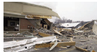
Finding victims of the Wayne furniture store explosion required the specialized skills of a Technical Rescue Team

Force One and deploy anywhere in the state when the need arises. Members from Oakland County, including Bloomfield Township, are recognized for their high level of training and expertise. The Township's participation in teams such as these is a way for communities to share services and resources, helping tax dollars go further.