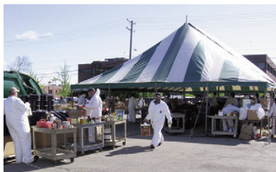
Household Hazardous Waste Drop-Off Day