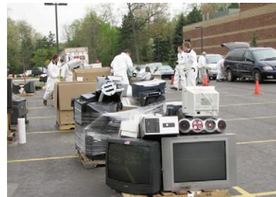
Electronics Recycling, Medication Disposal 2010

April 16 is also the date of the Electronics, Medication Disposal and Paper Shredding Event for Township residents. Residents may bring electronic waste items such as computers,