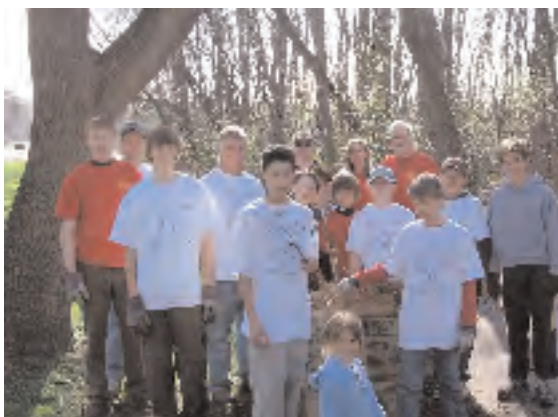
Boy Scouts of America Troop 1032, F.U.M.C. have participated in the Township's Clean Sweep program since it's inception.

Clean Sweep volunteers picked up a total of 13-cubic yards of trash and 17-cubic yards of yard waste throughout the Township during the April 21, Clean Sweep weekend. This year's event had